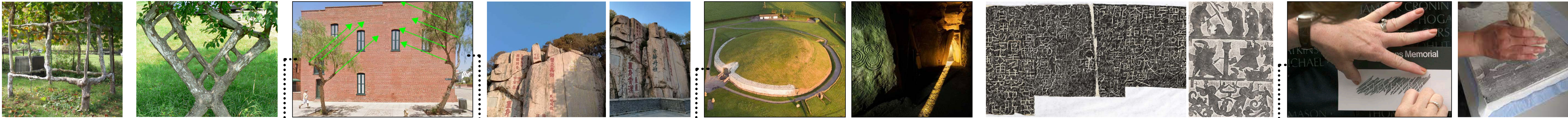
Dan Ladd, Grafted Trees

The landscape element will be coordinated with a landscape architect. Existing trees to be grafted together to create a knotted arch above the stone memorial creating a place of shade and reflection.