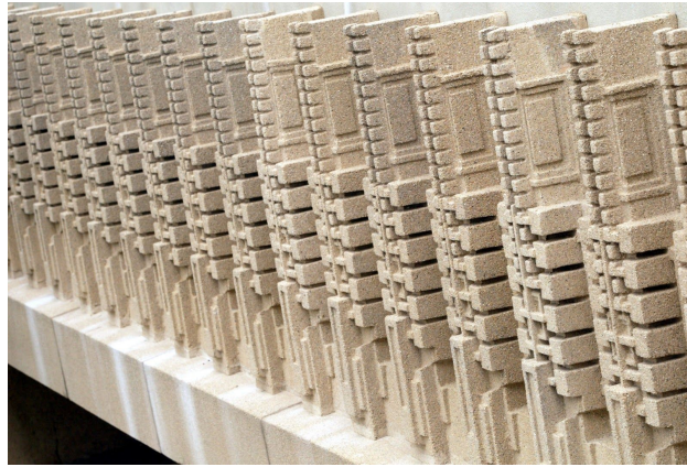
Detail from Hollyhock House.