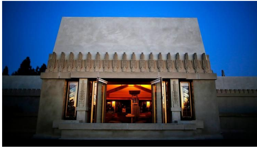
Hollyhock House, designed by Frank Lloyd Wright for oil heiress Aline Barnsdall.

http://www.latimes.com/entertainment/arts/la-et-cm-frank-lloyd-wright-houses-20170608-htmistory.html