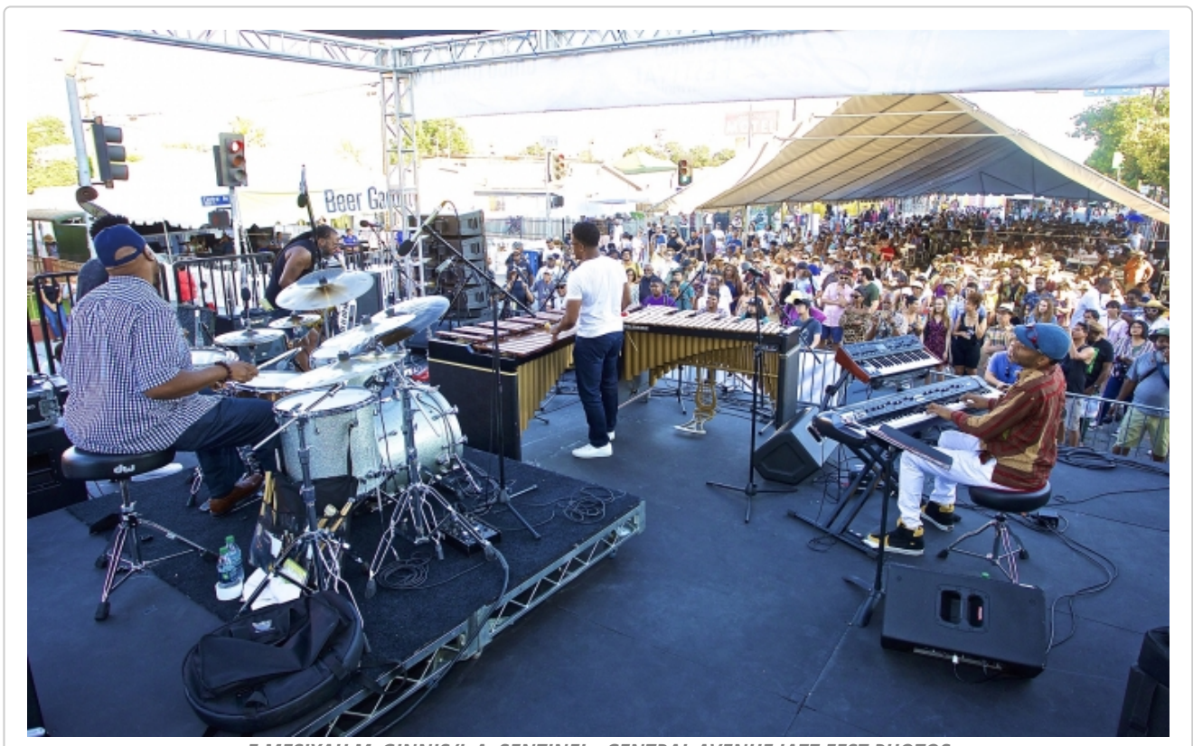
CENTRAL AVENUE JAZZ FEST PHOTOS

The festival offered four pavilions: The Balfour Beatty Youth Pavilion, with a number of activities, from Jumpers, Face painting and Airbrushing, to various art-making workshops; Health & Wellness Pavilion, providing basic health screenings, from blood pressure checks, diabetes/sugar, and immunizations for children and community awareness Health Talks; the Art Pavilion, featuring cutting-edge artwork from top artists in Los Angeles, including live art demonstrations by local muralists; and the Business Development & Employment Resources Pavilion, providing on site resources and information for emerging businesses, entrepreneurs, job seekers and employers.