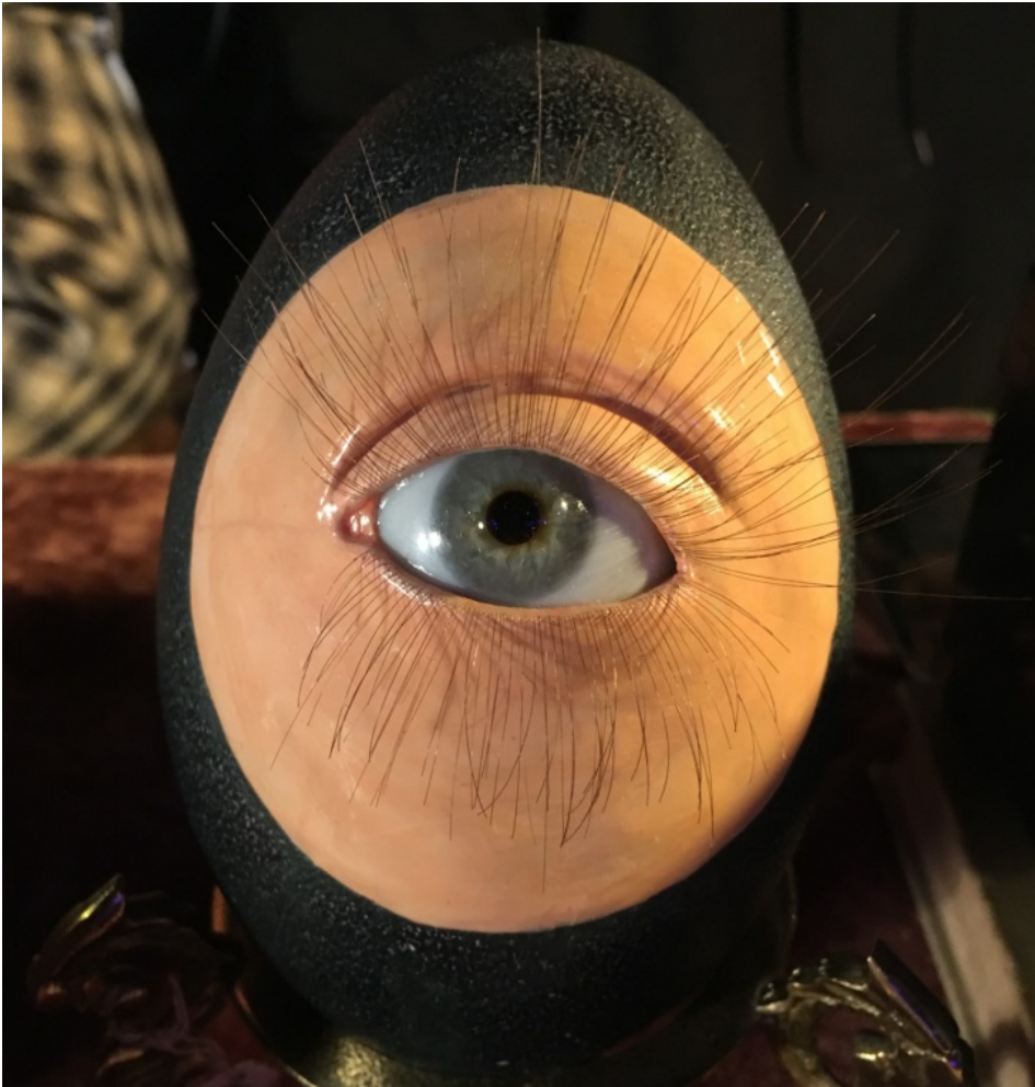
The Oddities Flea Market returns to the Globe Theatre in downtown L.A. this weekend, with eclectic vendors and makers.