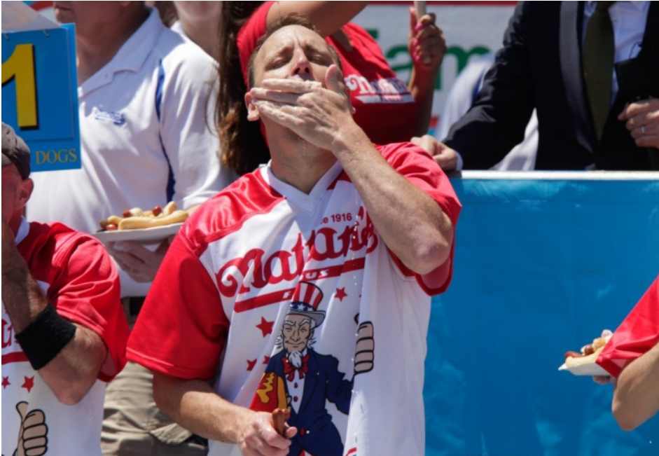
Joey Chestnut defends his taco-eating title and possibly sets a new world-record on Friday — National Taco Day — at the Santa Monica Pier.