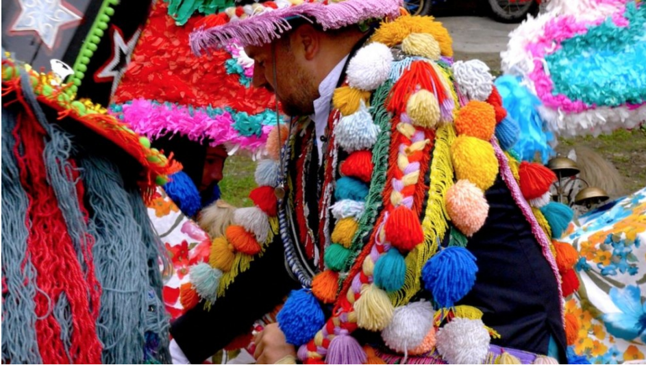
Grand Central Art Center in Santa Ana opens new exhibitions with a night of art and performance on Saturday night.