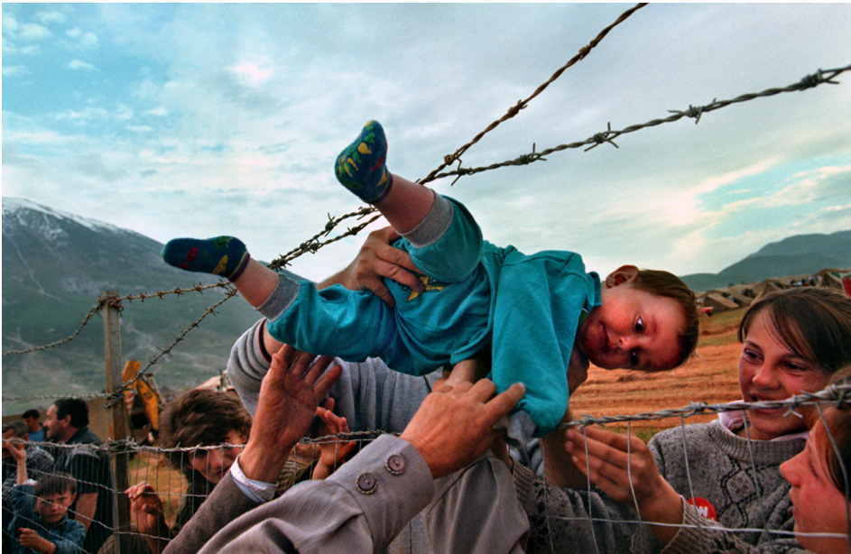
The Annenberg Space for Photography opens the new photo exhibition, 'W|ALLS: Defend, Divide, and the Divine' this weekend.