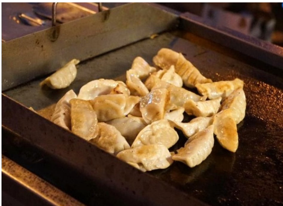
San Gabriel's Dumpling & Beer Fest returns to the Mission District on Friday night.