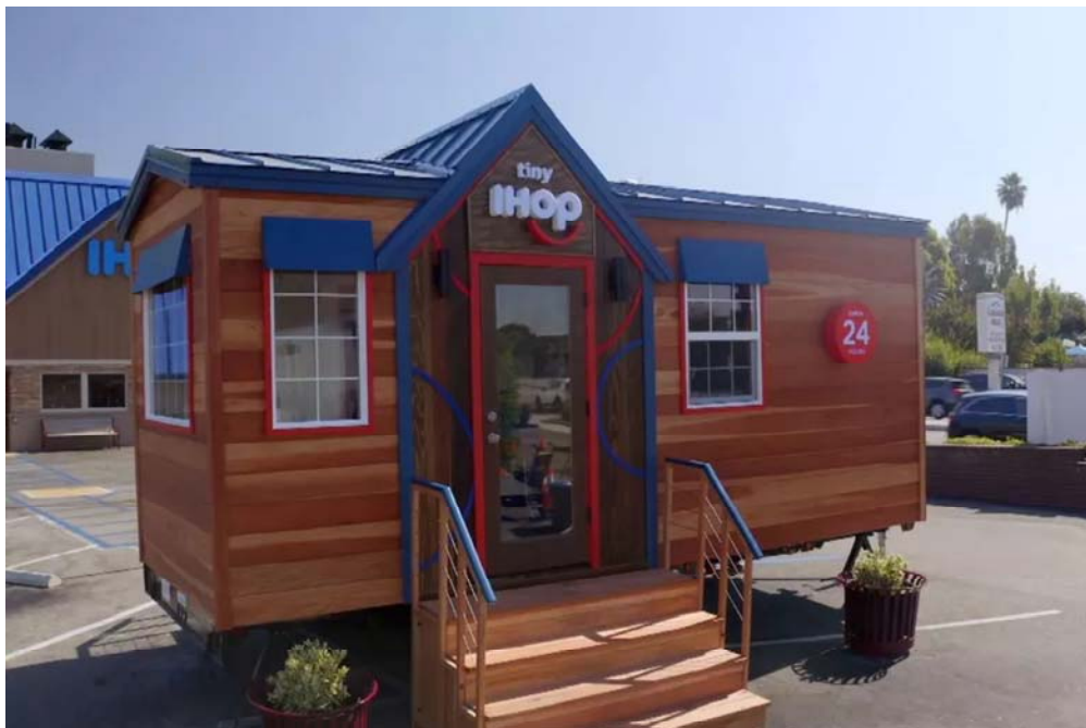
IHOP's tiny house | IHOP

by Farley Elliott | Oct 16, 2019, 9:11am PDT