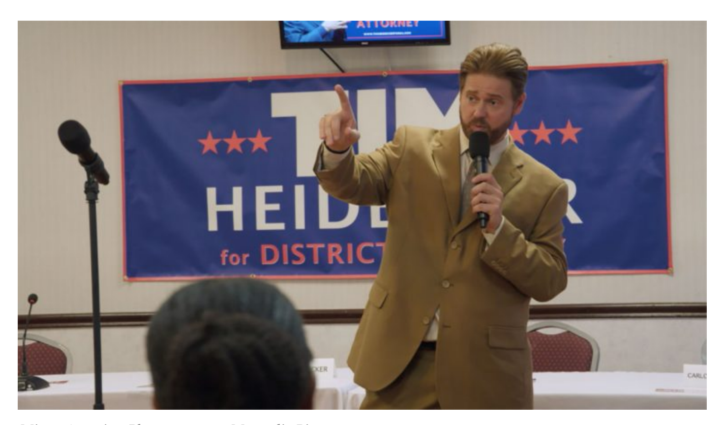
Mister America.

Center, (949) 835-1888. Wed., 7 p.m. $18.50-$20.50; and Art Theatre, (562) 438-5435. Wed., 7:30 p.m. $9-$12.