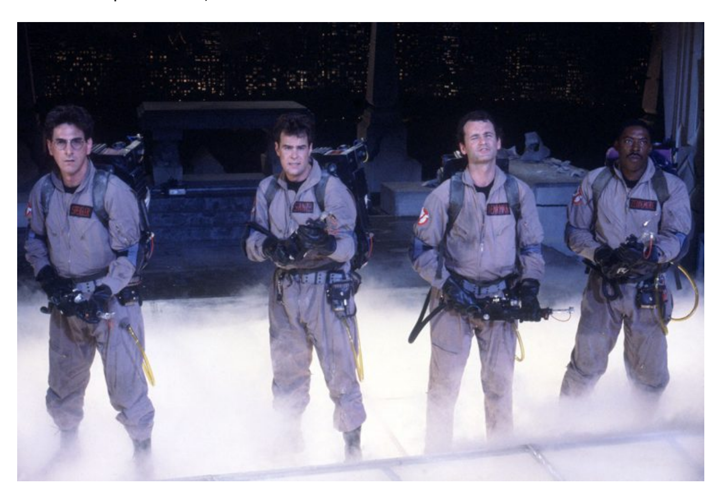
Ghostbusters.

The Beyond. Lucio Fulci's 1981 chiller is about a young woman restoring an old hotel she inherited—and discovering she inherited oh-so-much more than that. The Frida Cinema, 305 E. Fourth St., Santa Ana; thefridacinema.org. Thurs.-Fri., Oct. 3-4, 2:30, 4:30, 6:30 & 8:30 p.m. $7-$10.50.