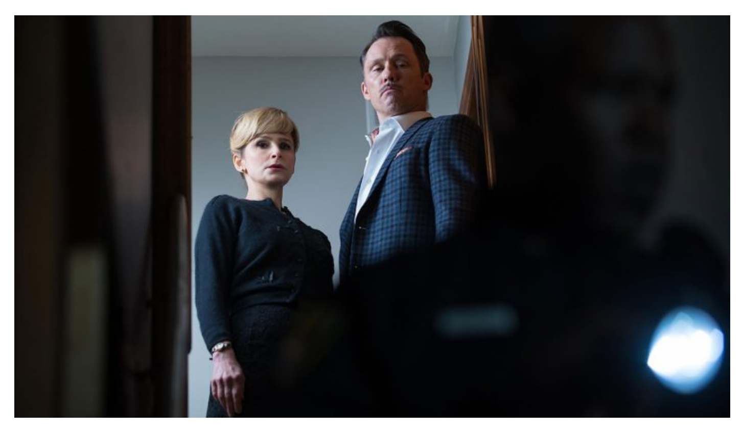
Villains.