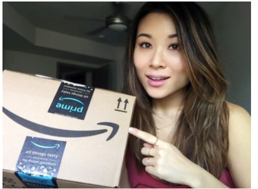
The Amazon Discount Trick Most People Don't Even Know of