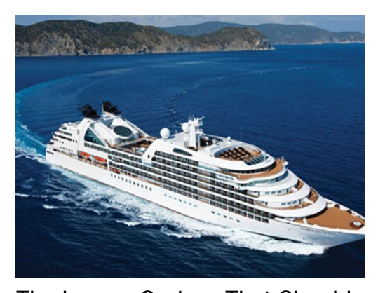
The Luxury Cruises That Should