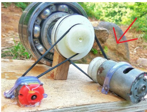
12x Better Than Solar Panels? This Unique Invention Takes