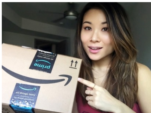
The Amazon Discount Trick Most People Don't Even Know of