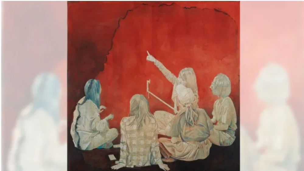
Rebecca Bird's 'Astral and Audience' is part of her "Circles" exhibit at Kopeikin Gallery in Los Angeles.

PUBLISHED: October 17, 2019 at 6:00 am | UPDATED: October 18, 2019 at 4:28 pm