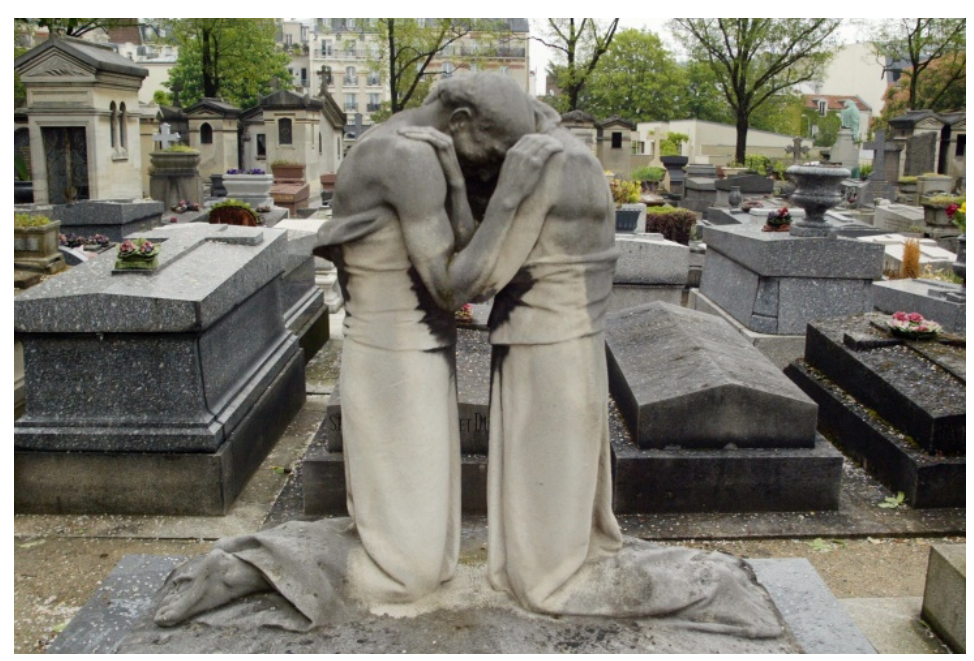
A new book explores the art and history of Père-Lachaise Cemetery in Paris.

Listen to songs about killers, scorned lovers, criminals and all-around terrible people. Expect performances by Caught A Ghost, Tashaki Miyaki, Los Dead Dreams, Gun Outfit and The Little Miss, among many others. This event is 18+. COST: $15; MORE INFO