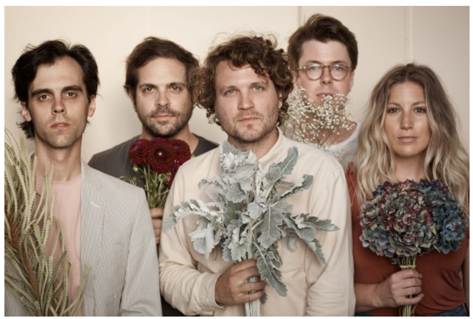
Ra Ra Riot headlines the Teragram Ballroom. (Rowan Daly)

Watch improv teams remix and remaster the 2004 horror film. Each group performs an act of the movie then the next group takes over where they left off. You never know what will happen, especially since some of the performers have never seen the movie. COST : $7; <u>MORE INFO</u>