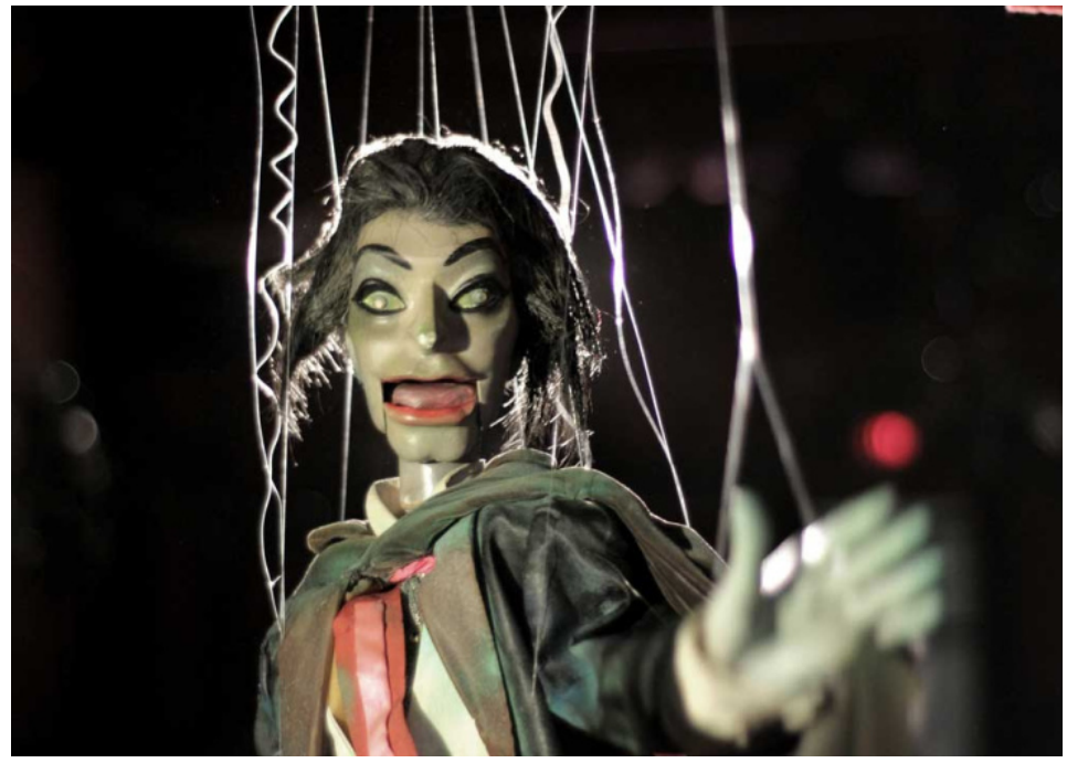
The Bob Baker marionettes perform a Halloween show at One Colorado in Pasadena.