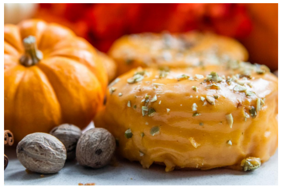
Astro Doughnuts & Fried Chicken in Santa Monica is giving away free pumpkin donuts on Halloween.

https://laist.com/2019/10/28/22_things_to_do_events_los_angeles_southern_california_halloween_oct28_2019.php