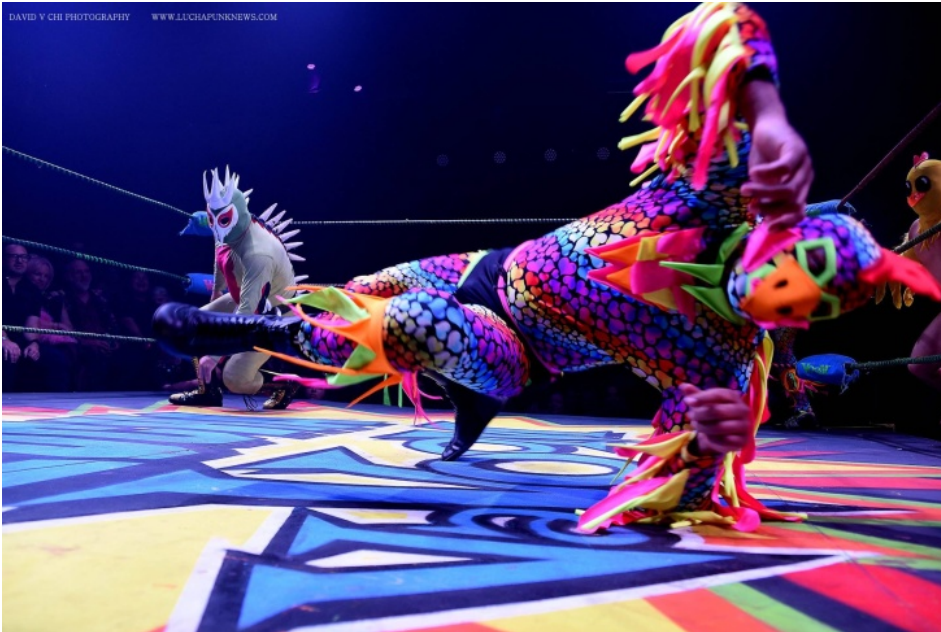
Lucha Va Voom returns to the Mayan Theater this week for its Valentine's-themed wrestling spectacular.

Lucha va Voom rings in Valentine's Day a little early. Ben Lee and Lone Skye celebrate Valentine's Eve with friends. Frankenstein gets a new life onstage. Mavis Staples sings. Henry Winkler gets feted. David Mamet brings a new theater production to L.A.