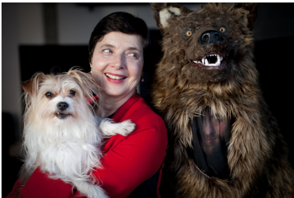
A publicity photo for Isabella Rossellini's Link Link Circus.