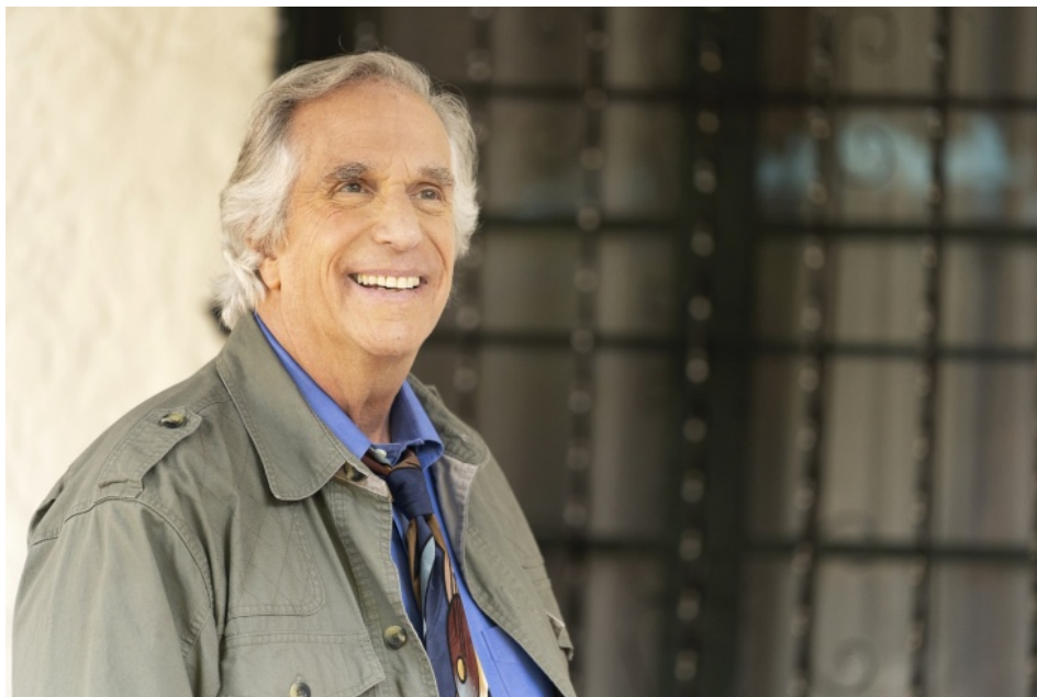
Ayyyy: The Paley Center celebrates the career of Henry Winkler, from 'Happy Days' to 'Barry.'