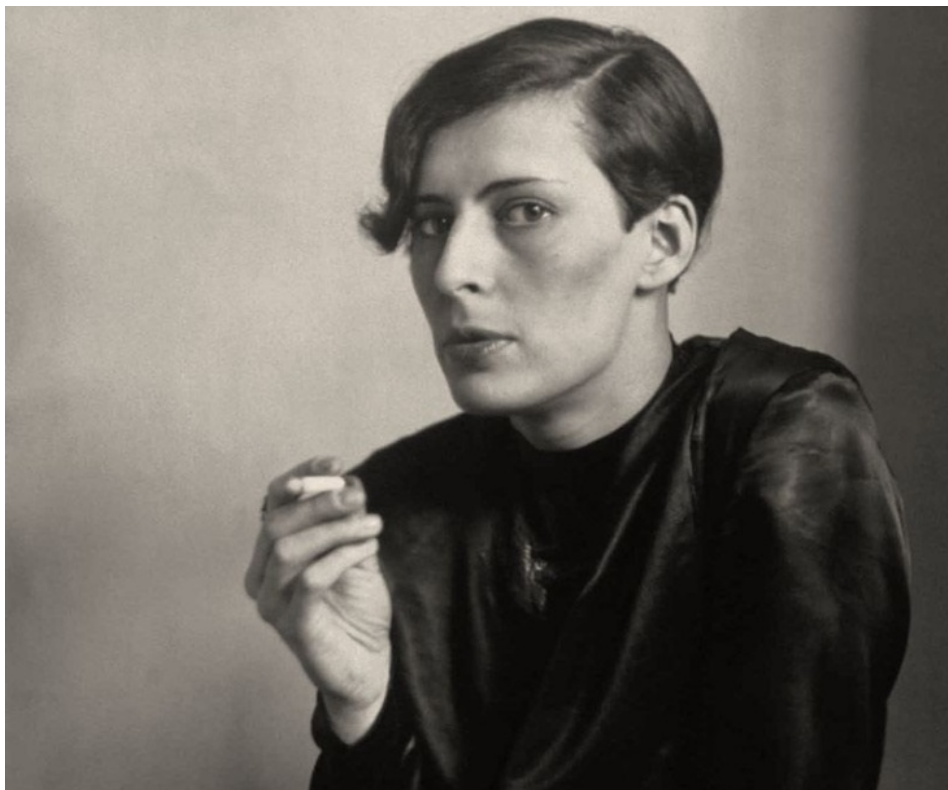
Hauser & Wirth opens an exhibition of works by German photographer August Sander, including Secretary at West German Radio in Cologne (detail).