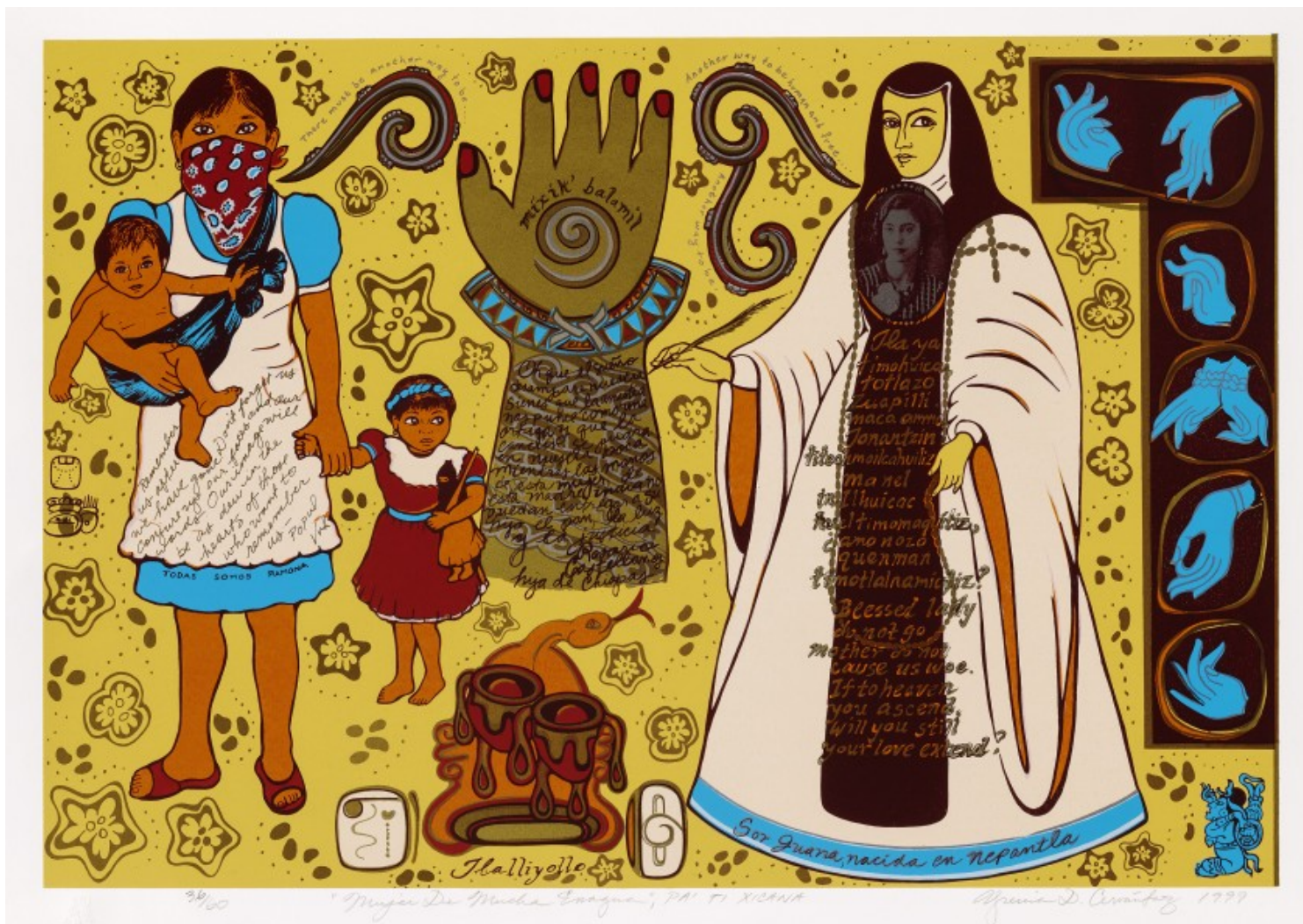
“Mujer de Mucha Enagua, PA' TI XICANA,” 1999, by Yreina D. Cervántez collages images that reflect a range of artistic influences. (Yreina D. Cervántez / SAAM)