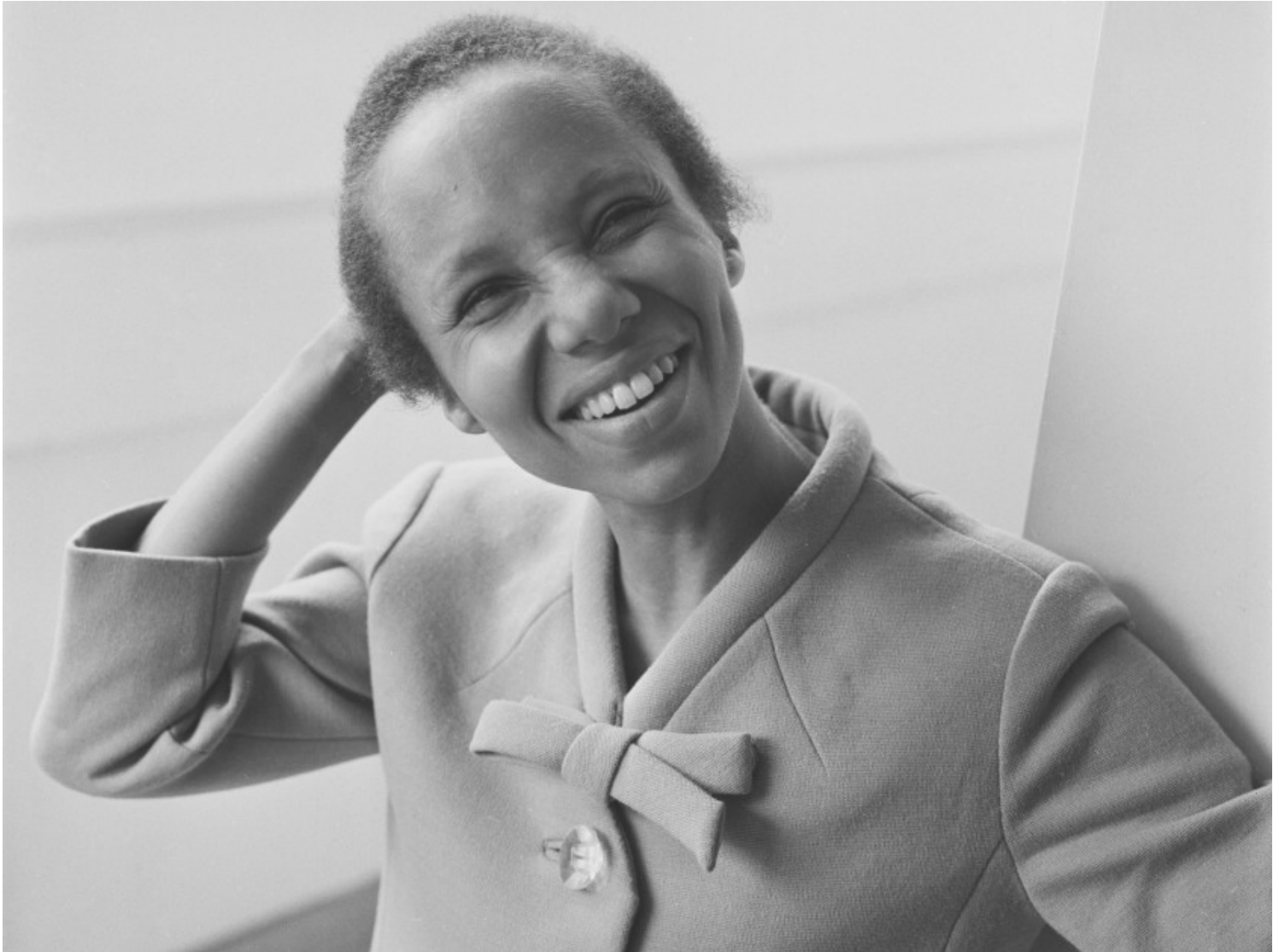
American playwright Adrienne Kennedy in 1967.