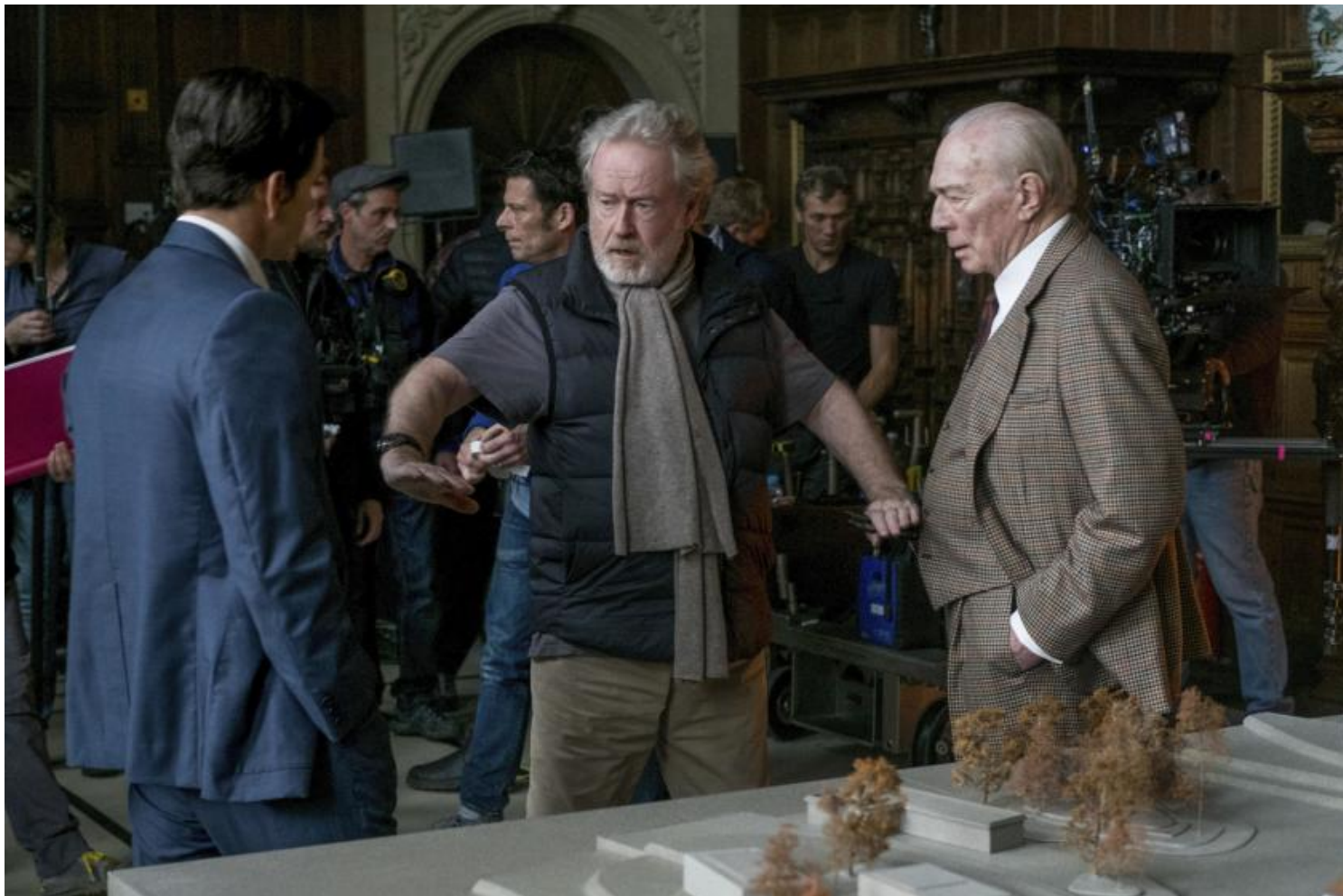
Actor Christopher Plummer, right, on the set of Ridley Scott's "All the Money in the World."

Christopher Plummer , the debonair Canadian actor who played Capt. Von Trapp in the filmed version of “ The Sound of Music ,” and earned an Emmy, a Tony and an Academy Award in his 50-year career in film, television and the stage, has died at 91 . “I’m so sorry for people who actually do want to retire,” he said in 2015, “it means that they haven’t loved what they do in life.”