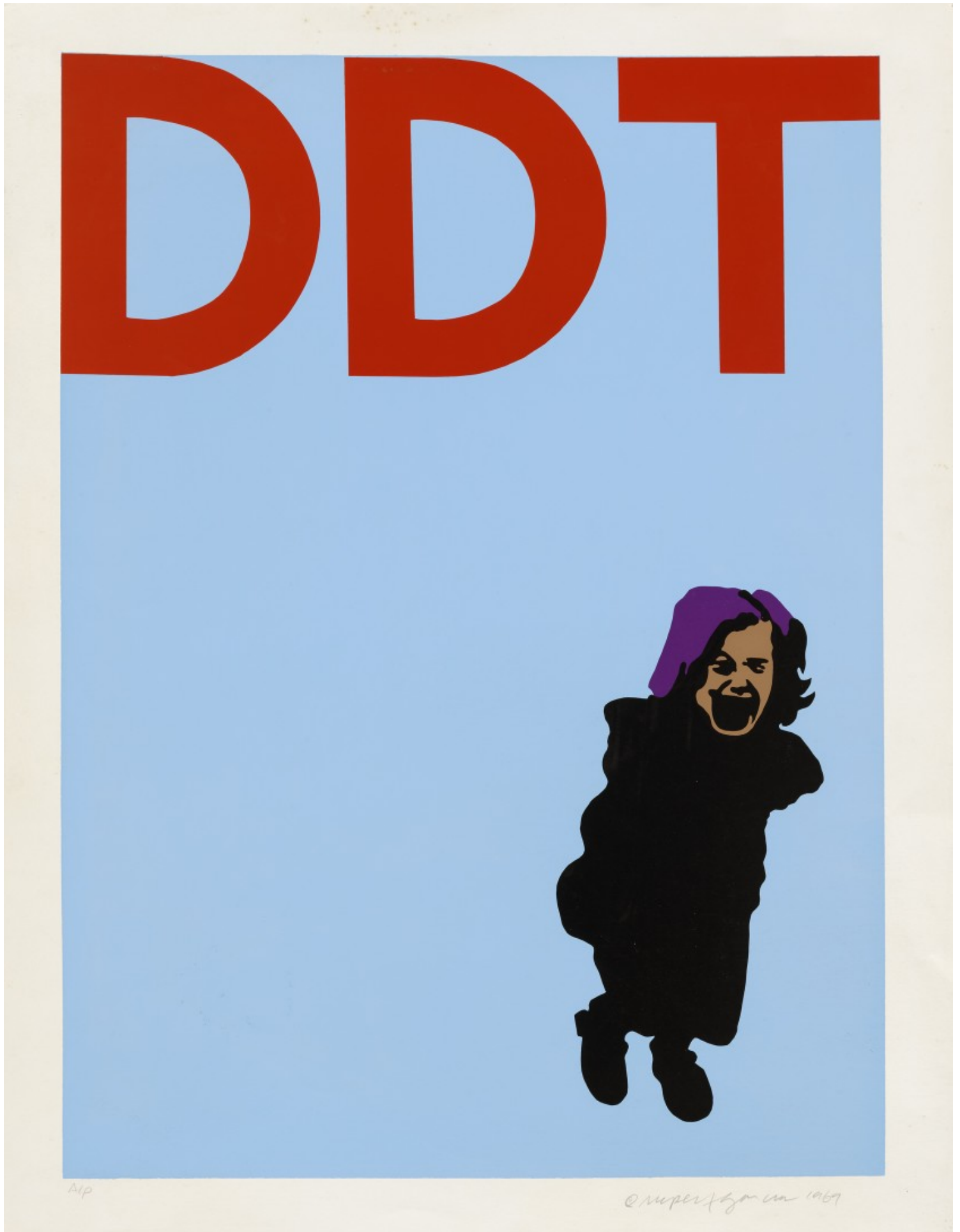
"DDT," 1969, by Bay Area Rupert García. With flat colors, García evoked the language of Pop. (Rupert García / SAAM)